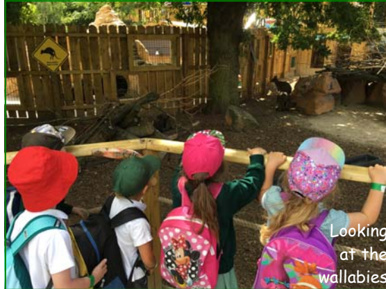
Looking at the wallabies