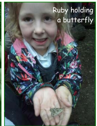
Ruby holding a butterfly