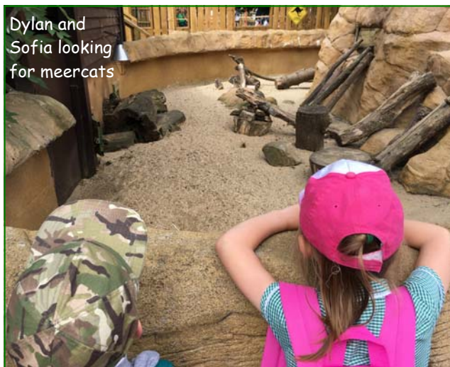
Dylan and Sofia looking for meercats