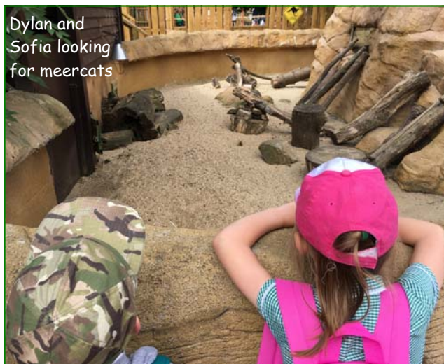
Dylan and Sofia looking for meercats