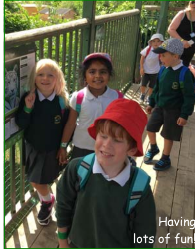
Having lots of fun!