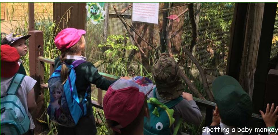
Spotting a baby monkey