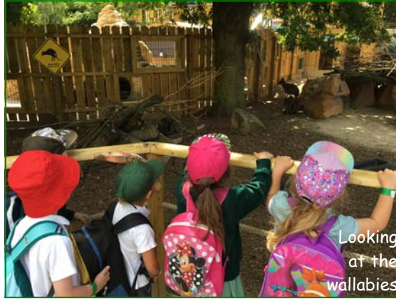
Looking at the wallabies