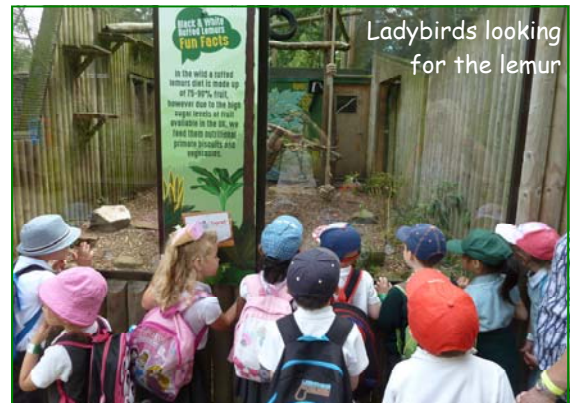
Ladybirds looking for the lemur