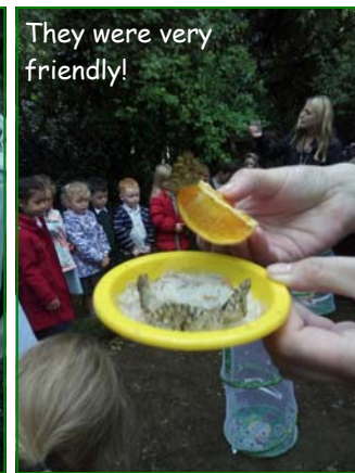
They were very friendly!