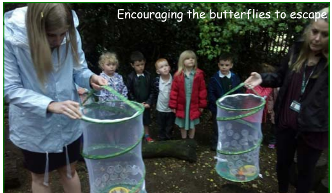
Encouraging the butterflies to escape