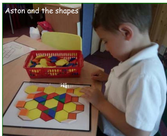
Aston and the shapes