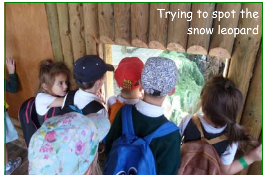
Trying to spot the snow leopard