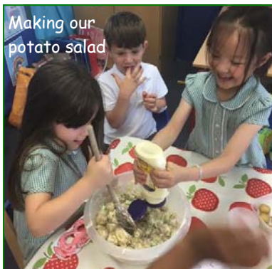
Making our potato salad

We entered a competition this year to see which school could grow and harvest the heaviest potatoes! We did not win but we had a bumper crop of over 100!! We really enjoyed making our potatoes into potato salad.