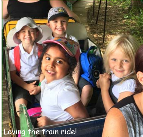
Loving the train ride!