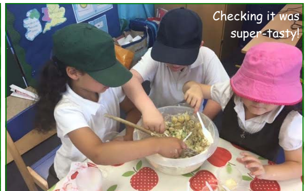
Checking it was super-tasty!