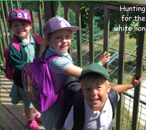
Hunting for the white lion