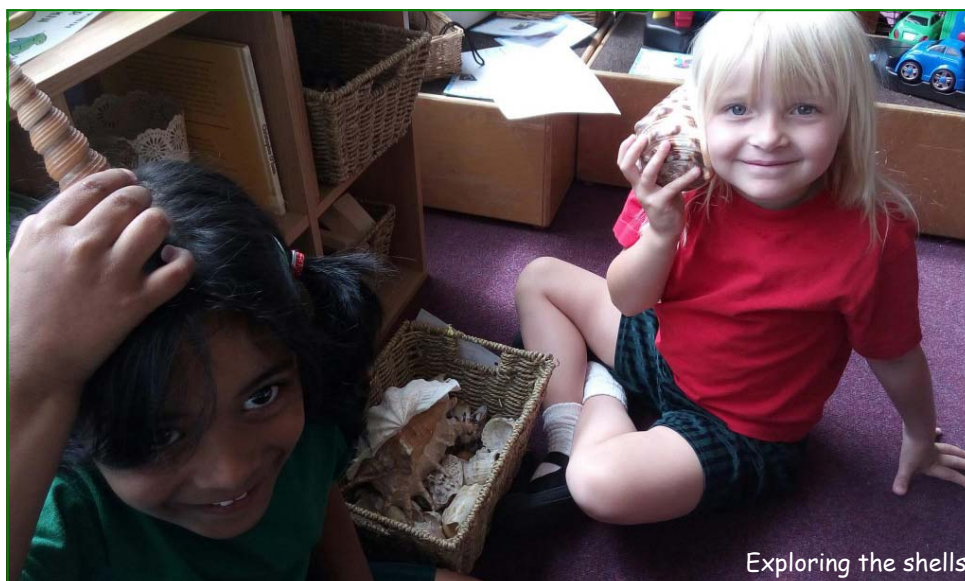
Exploring the shells