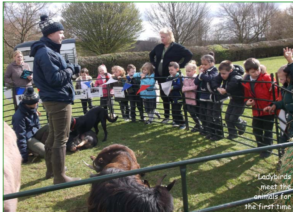
Ladybirds meet the animals for the first time