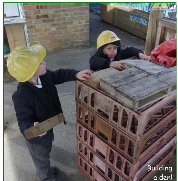
Building a den!