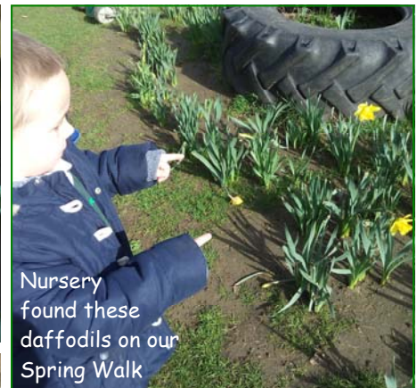
Nursery found these daffodils on our Spring Walk