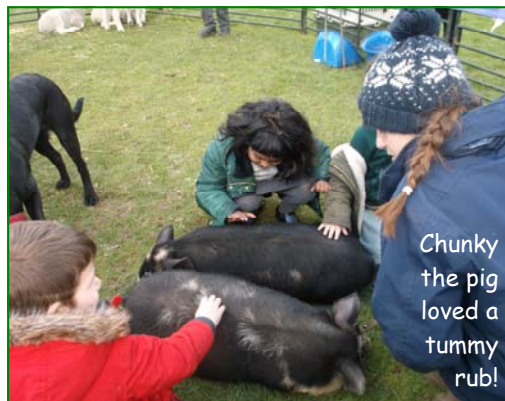
Chunky the pig loved a tummy rub!