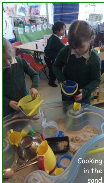
Cooking in the sand