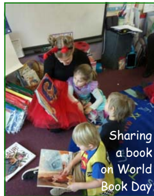
Sharing a book on World Book Day

This half term has been all about the farm! We have looked at the story of Farmer Duck and loved orally retelling it and innovating our own. Reception have done lots of work based on non-fiction books and writing recipes (which we then obviously had to cook!) It has been a very busy but very fun half-term, with World Book Day, our fantastic topic and many visitors coming in to see us - plus we have had visits from the farm (more photos on the next page) and from a dog called Flick!