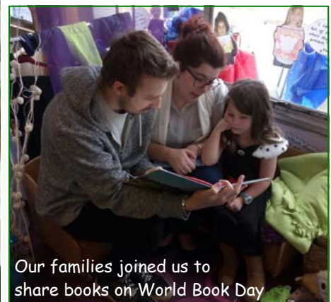
Our families joined us to share books on World Book Day