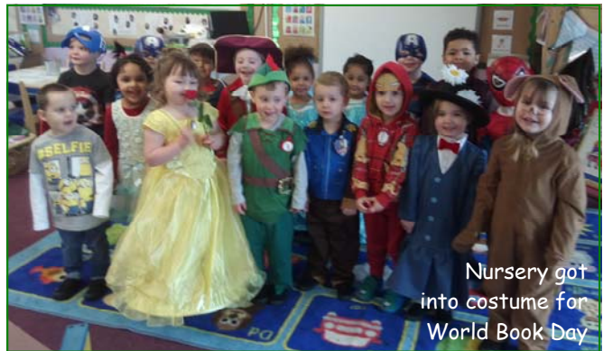
Nursery got into costume for World Book Day