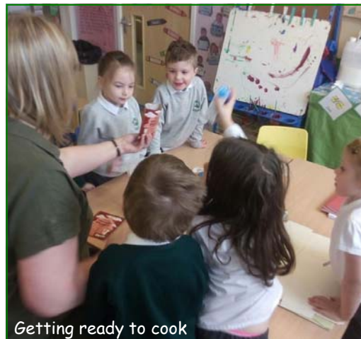
Getting ready to cook