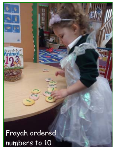
Frayah ordered numbers to 10