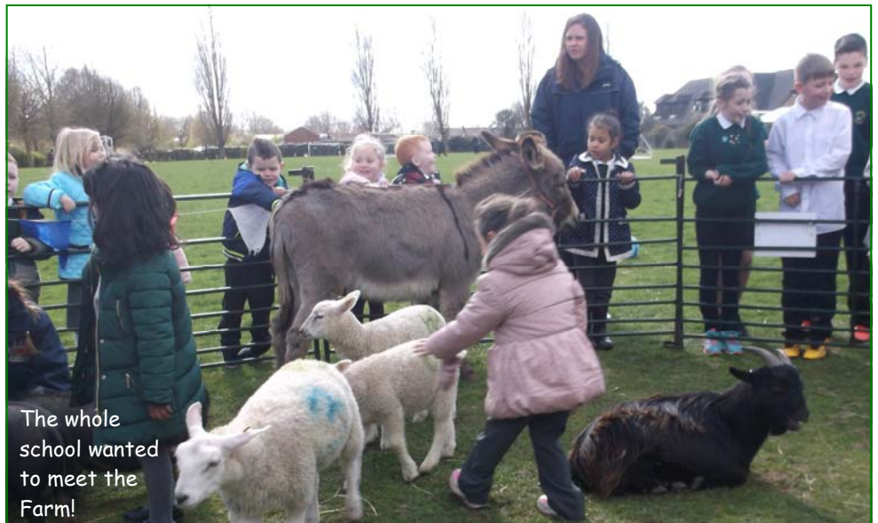
The whole school wanted to meet the Farm!