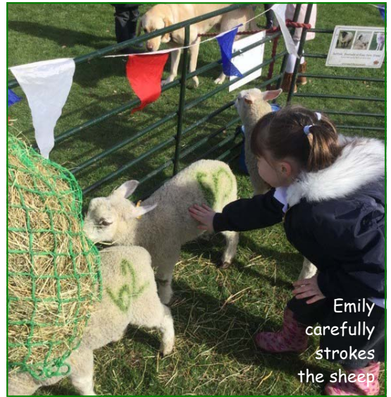
Emily carefully strokes the sheep