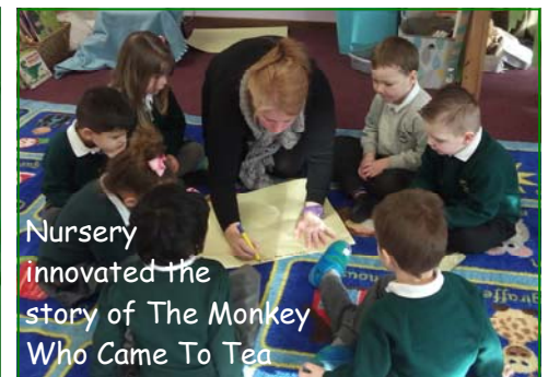
Nursery innovated the story of The Monkey Who Came To Tea