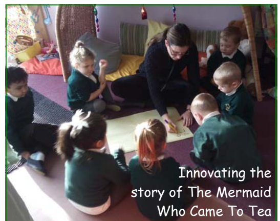
Innovating the story of The Mermaid Who Came To Tea