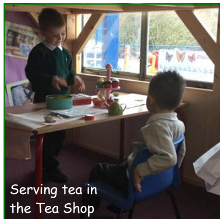
Serving tea in the Tea Shop

We have had lots of fun this half-term with our story The Tiger Who Came To Tea . We received a letter inviting us to a tea party, and then created story maps, orally retold the story and innovated upon it. We have absolutely loved inventing our own stories and have many different animals come to tea such as monkeys, dinosaurs and ponies!