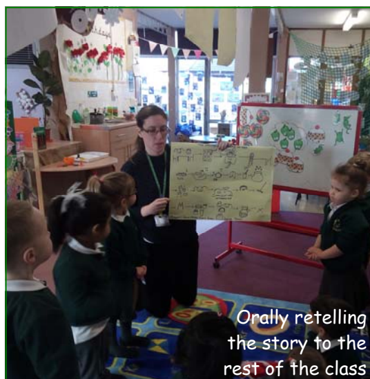
Orally retelling the story to the rest of the class