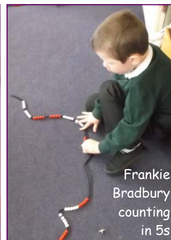
Frankie Bradbury counting in 5s