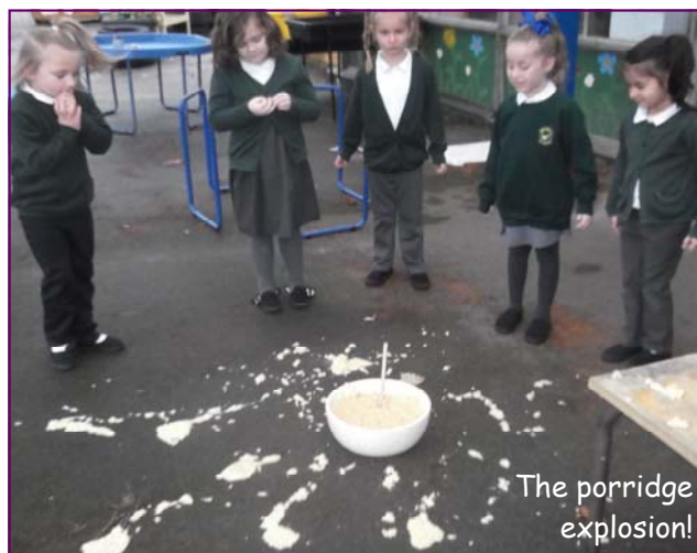
The porridge explosion!

In the first half of the Spring term, our text was The Magic Porridge Pot . We have learnt this story by heart and had great fun exploring it - and the porridge, too! We made porridge monster poems, cooked flapjacks using the porridge oats and made instructions for others to follow. We have taken on the part of characters within the story through role play and hot seating, coming up with our own questions to ask, and wrote letters to friends telling them about the porridge flood.