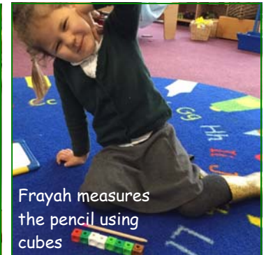
Frayah measures the pencil using cubes