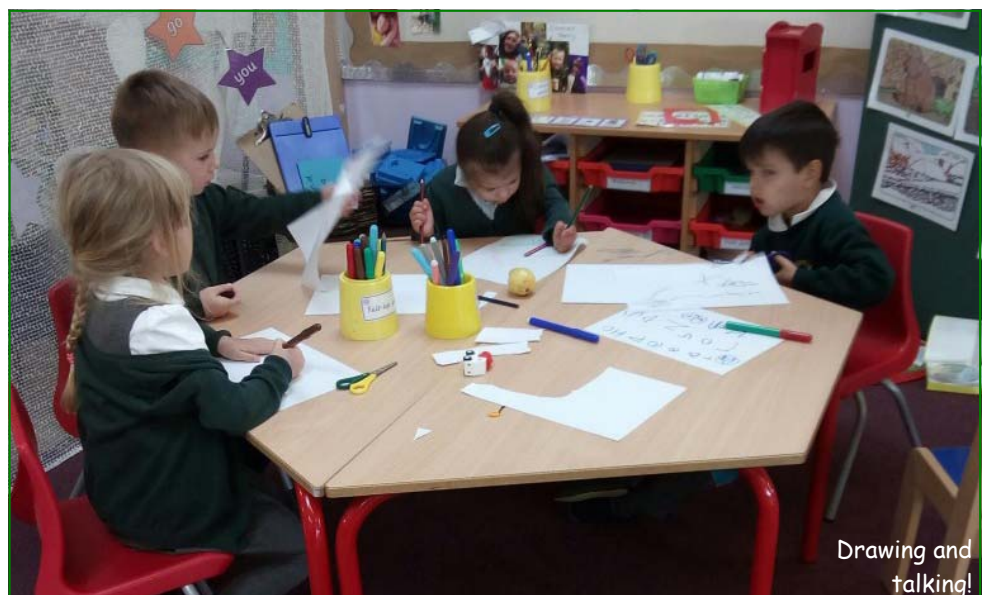
Drawing and talking!