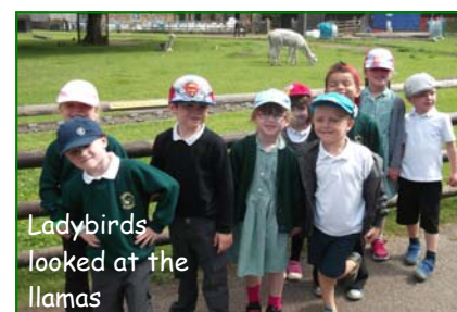
Ladybirds looked at the llamas