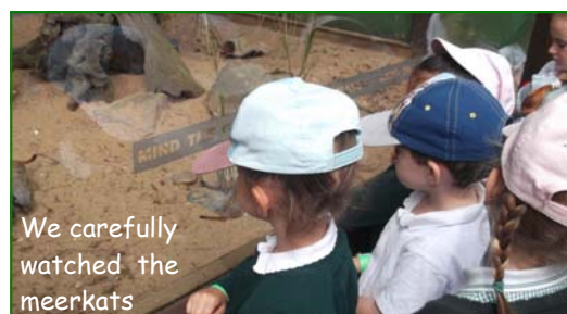
We carefully watched the meerkats