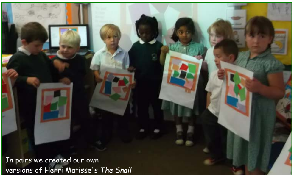
In pairs we created our own versions of Henri Matisse's The Snail