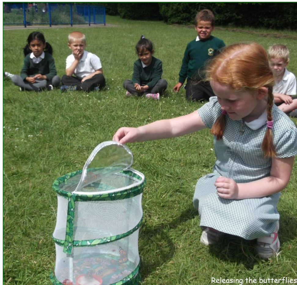
Releasing the butterflies