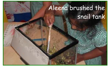
Aleena brushed the snail tank