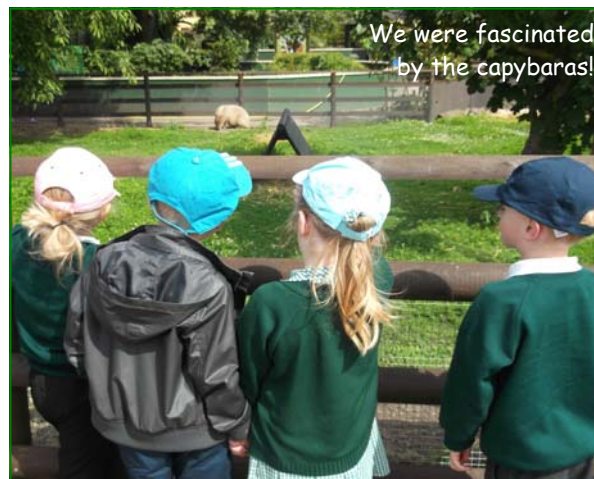
We were fascinated by the capybaras!