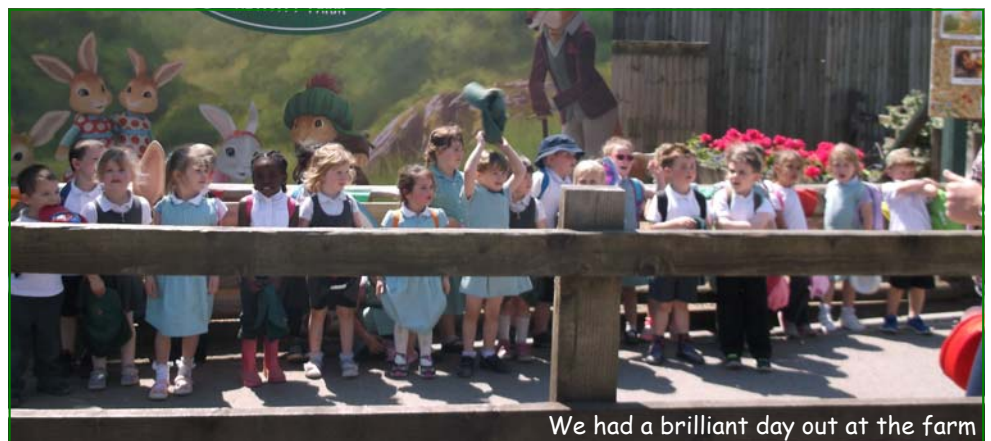
We had a brilliant day out at the farm