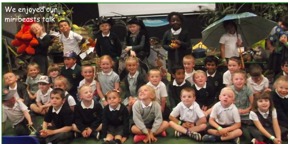
We enjoyed our minibeasts talk