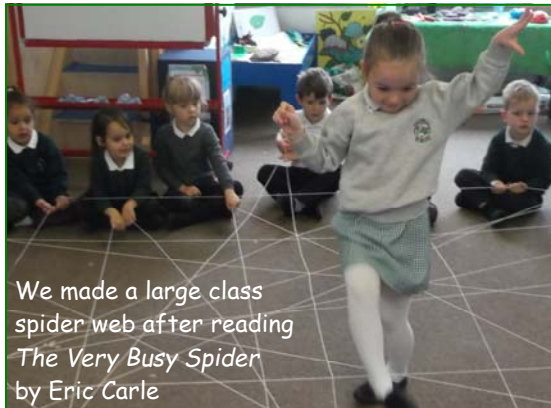
We made a large class spider web after reading The Very Busy Spider by Eric Carle