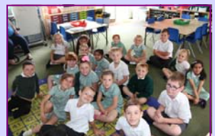
Our whole class!