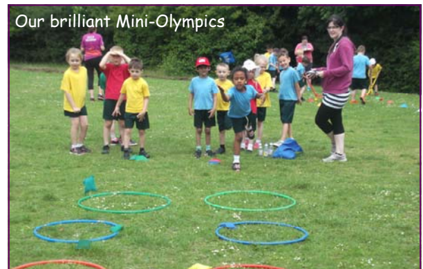
Our brilliant Mini-Olympics