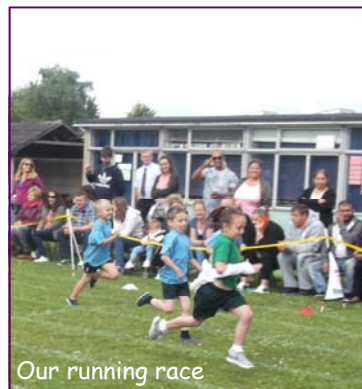
Our running race