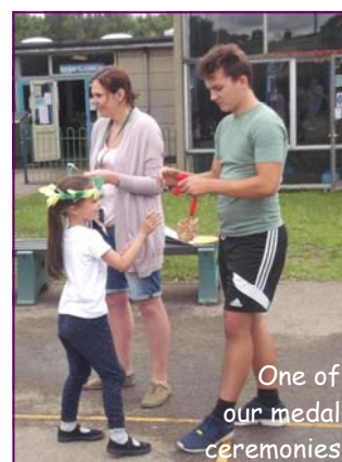
One of our medal ceremonies