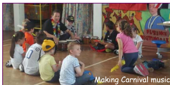
Making Carnival music