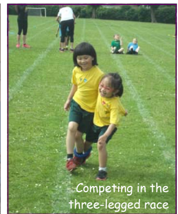
Competing in the three-legged race