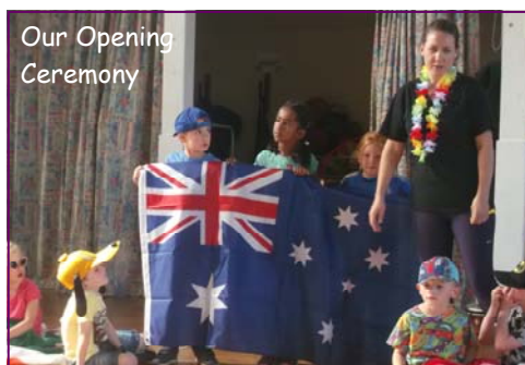
Our Opening Ceremony