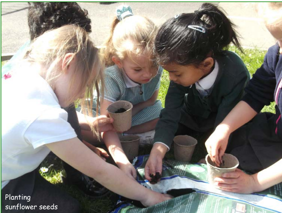
Planting sunflower seeds