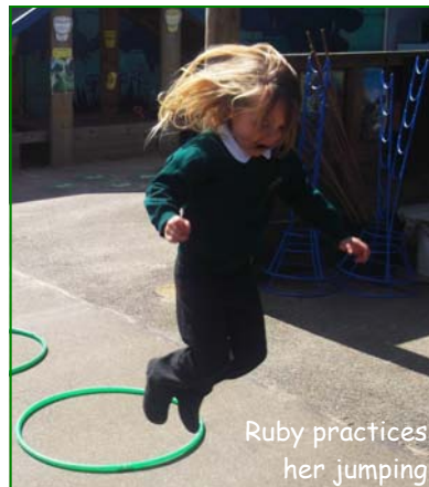
Ruby practices her jumping