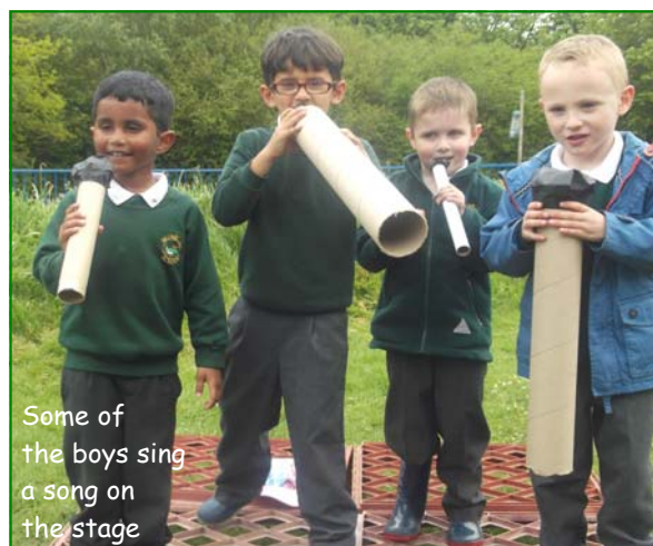
Some of the boys sing a song on the stage