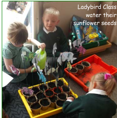
Ladybird Class water their sunflower seeds