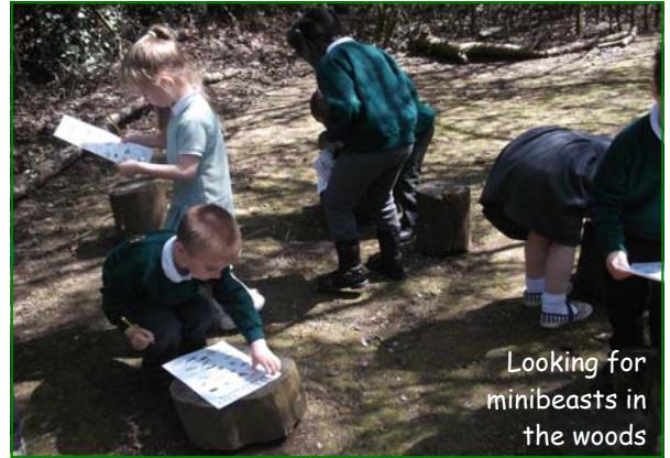
Looking for minibeasts in the woods